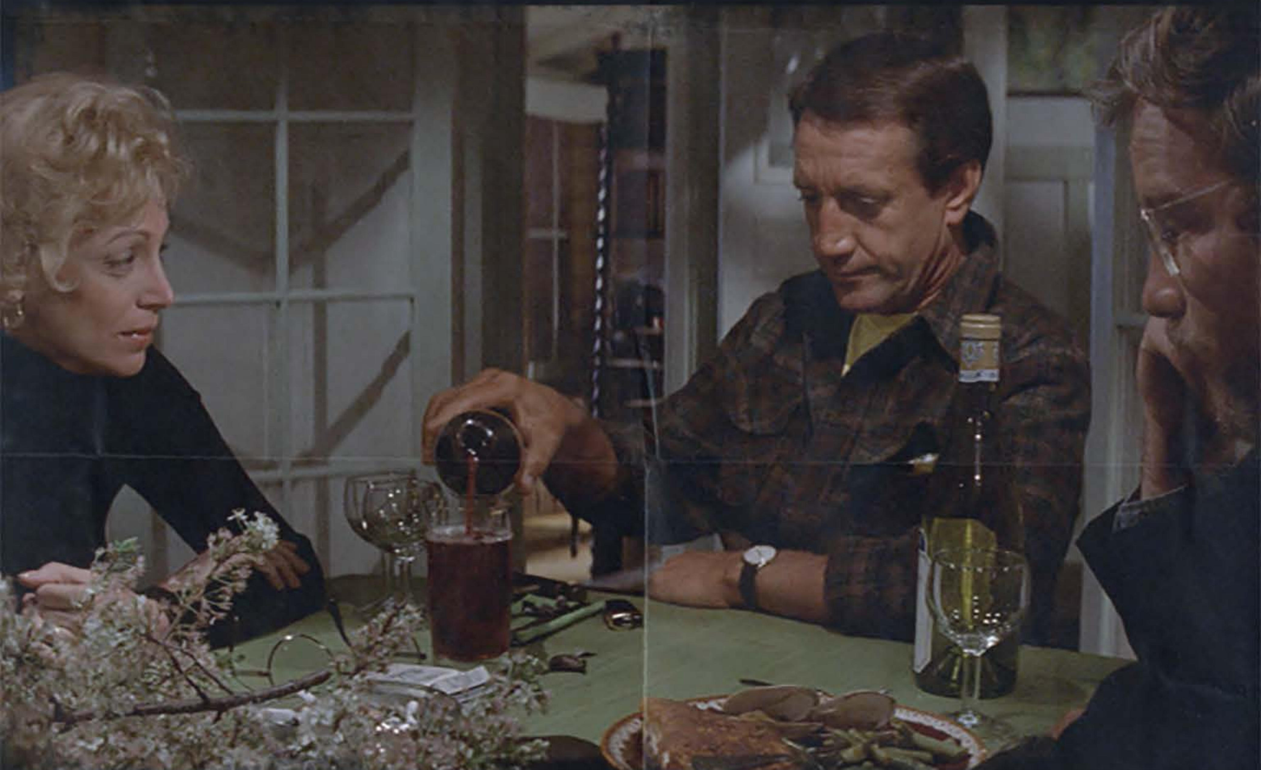
JAWS DIRECTOR STEVEN SPIELBERG