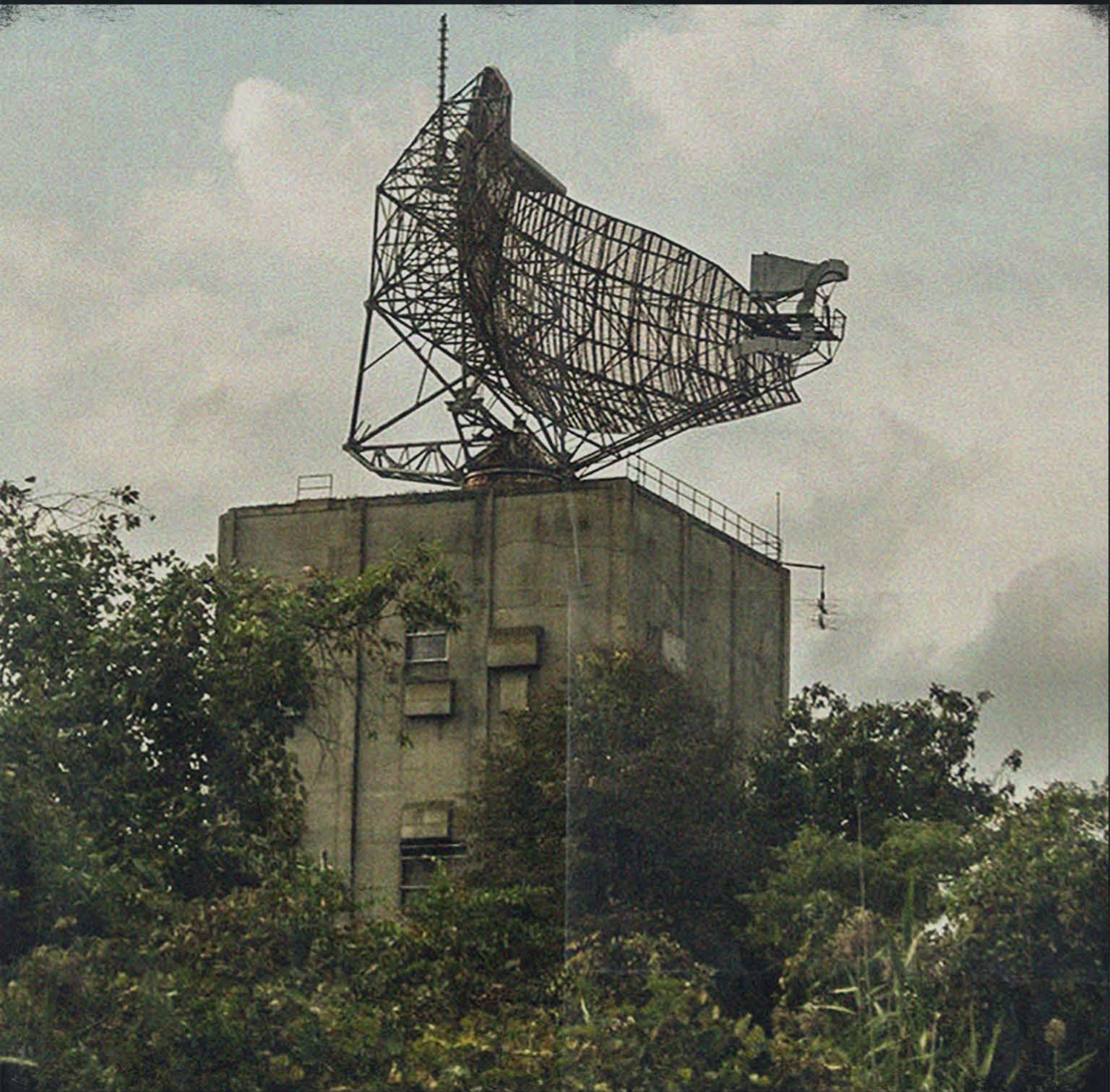
CAMP HERO AIR FORCE BASE MONTAUK, LONG ISLAND CIRCA 1980