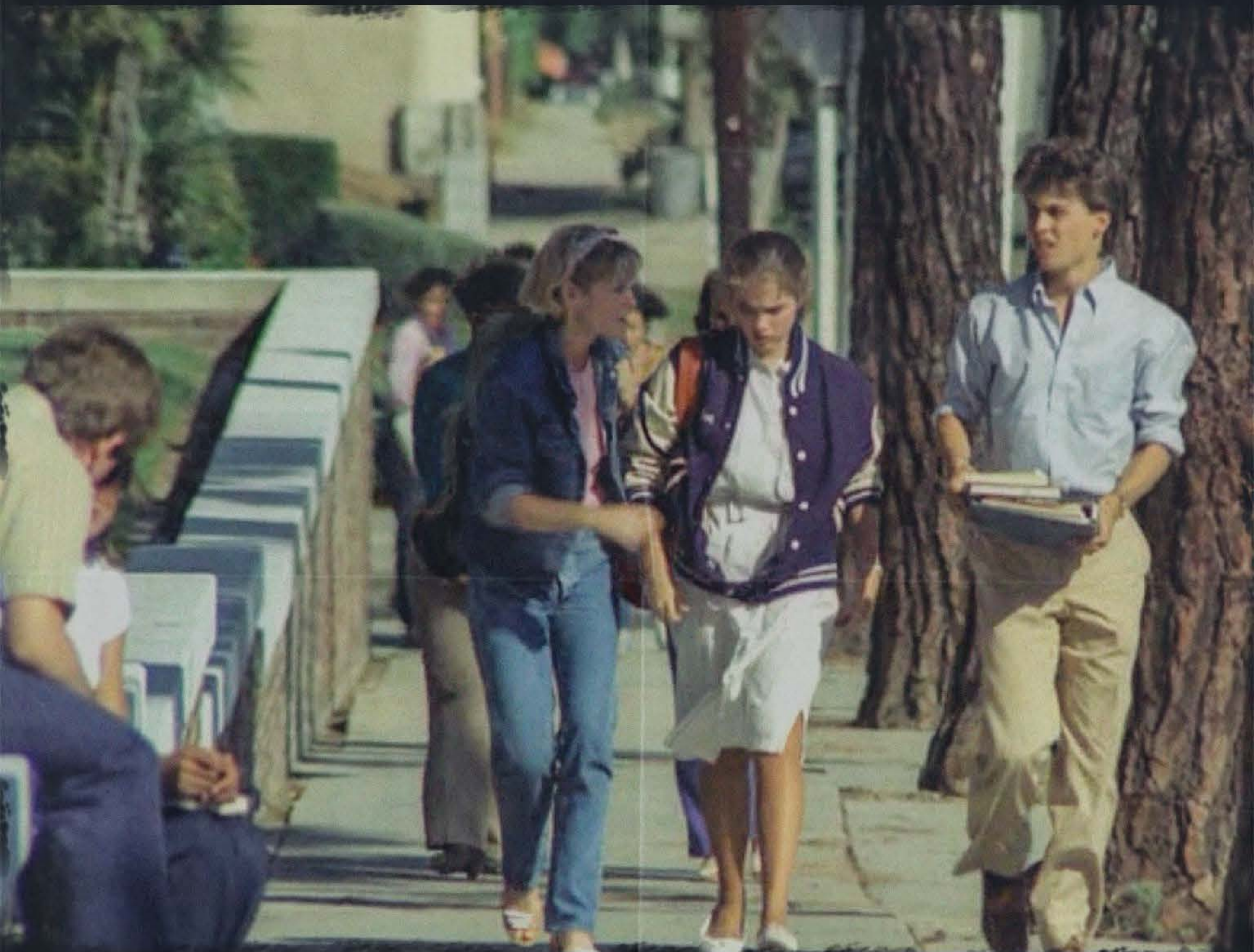
A NIGHTMARE ON ELM STREET DIRECTOR WES CRAVEN ©1984 NEW LINE CINEMA CORP